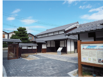
3. Former Ueda Family Residence