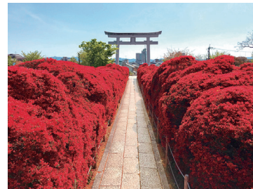
5. Nagaoka Tenmangu Shrine

Yanagidani Kannon (Yokokuji Temple) is located in Nagaokakyo City, not far from Kyoto City and close to the famous Otokuni Bamboo Grove. Hydrangea Path is a famous place to enjoy hydrangeas and includes over 4,500 hydrangea plants that bloom in June and in the summer months. In autumn, the deep red carpet of the Kamishoin Study and bright red autumn foliage creates an impressive sight. It's also widely believed that there is holy water ("oko-zui") at Yokokuji Temple connected to the famous Buddhist monk Kukai, and that this water is thought to heal diseases of the eye.