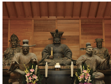
9. Hoshakuji Temple