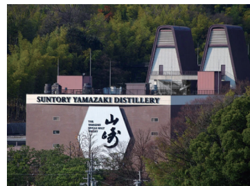
8. Suntory Yamazaki Distillery

Situated at the foothills of Mount Tennozan Somei Yoshino cherry blossoms and weeping cherries sprawl over a 18,200m 2 garden, highlighting the beauty of the 100 year old Oyamazaki Villa. Along with the additional building designed by the architect Tadao Ando, the English style villa opened as museum in 1996. It is home to unique artworks such as Monet's "Water lilies."