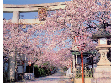
2. Mukojinja Shrine

Take no Michi (The Muko Bamboo Path) is approximately 1.8km, which is 5 times longer than the Arashiyama bamboo grove and yet less crowded and quieter. The grove was chosen as "the most breathtaking greenery" by one of Japan's major travel magazines. While enjoying the sunshine pouring through the leaves, you may also discover Japanese craftsmanship in 8 kinds of bamboo fences.