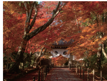
6. Komyoji Temple